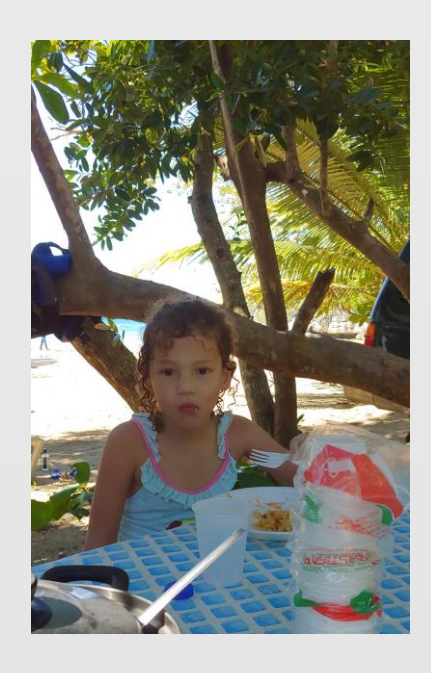
Great food with great family.