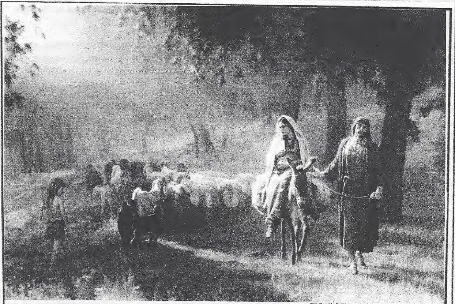
The Road to Bethlehem, by Joseph Erickey, © 2003 Joseph Erickey