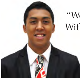
Elder Reef Goo