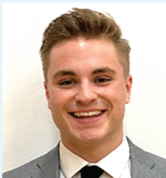
Elder Cannen Hall