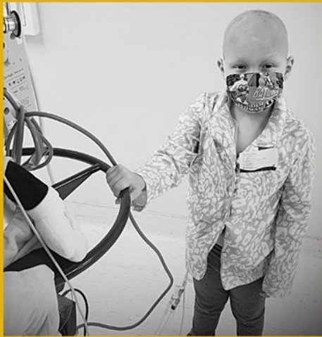
In Honor of Claire Medulloblastoma, Angel

Your Donations help speed the healing process of children